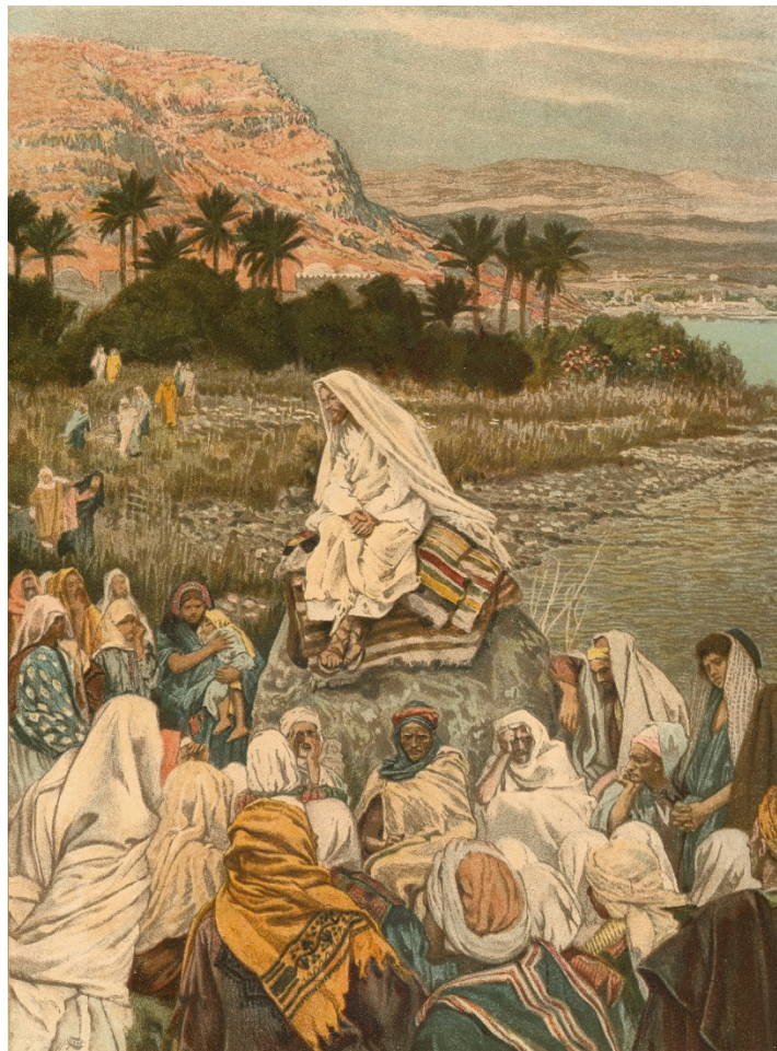
Jesus Teaching on the Sea Shore